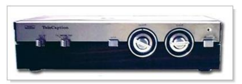
Figure 4: The TeleCaption Decoder I, the first captioning decoder, originally appeared in the 1980 spring Sears catalog and cost $250.

Dr. Norwood: Well, I guess that almost has to be an individual decision. But the built-in decoder is cheaper because it adds only about $75 to $100 to the cost of that TV set. For example, if a color TV set costs us about $425, with the TV built-in adapter, add $75. It costs about $500.