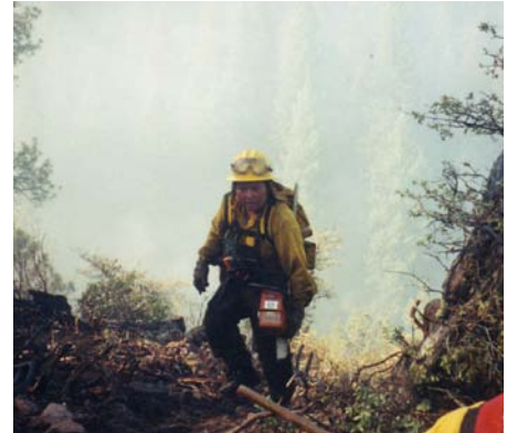
Apache 8 in the smoke.