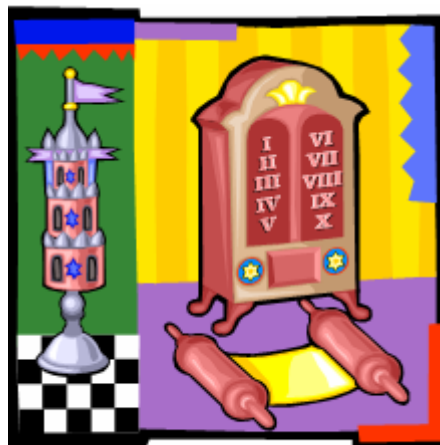
The Dead Sea Scrolls