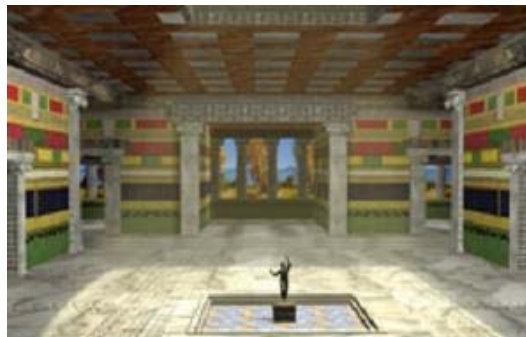
House of Faun