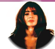
Evelyn Glennie (1965- )