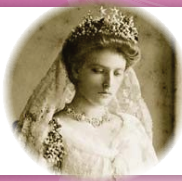
Princess Alice of Battenberg (1885-1969)