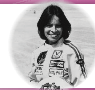
Kitty O'Neil (1946- )