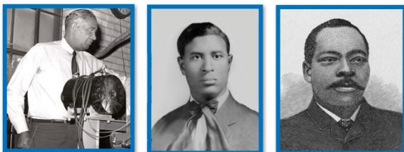
Above: Harriet Tubman; George Washington Carver; Dr. Martin Luther King, Jr.; Rosa Parks; Sojourner Truth; A. Phillip Randolph; Frederick Douglass; and Dr. Percy Julian.